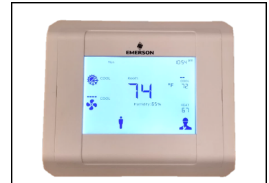
Touchscreen Thermostat and Supervisor Compatibility Matrix