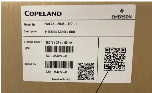
On packaging nameplate

For example, QR code on shipment will be as below: