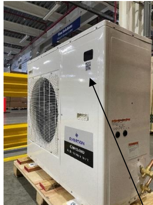
On Condensing Unit