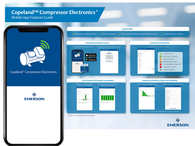
Copeland Compressor Electronics App