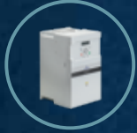
FREQUENCY DRIVE (EVM) Compressor matched