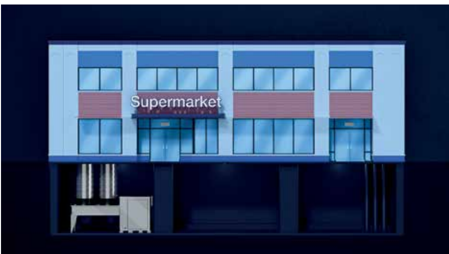
packaged indoor installation