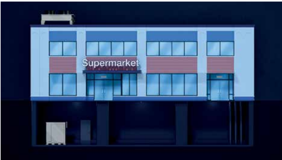
split indoor/outdoor installation